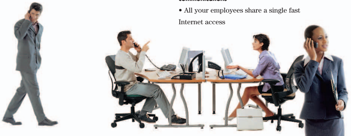
VOICE+INTERNET+DATA All-in-one box