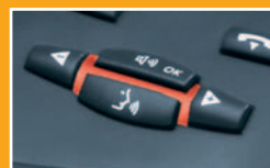
▲ Audio control keys

Audio control functions (loudspeaker volume control, hands-free audio control, mute, etc) are separated from the system's function keys to facilitate easy and clear audio control for the user.