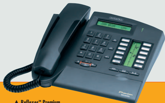
▲ Reflexes™ Premium