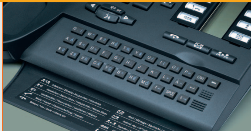
▲ Alphabetical keyboard

The Alcatel Premium and Advanced Reflexes™ are equipped with an alphabetic keyboard. This device allows access to the "call by name" company directory and to "text mini-messaging" services.