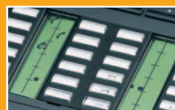
▲ Labels you can customize. Large transparent key tops

Programmable system or user keys are available on the Alcatel Reflexes™. Labeling can be standardized at a corporate level and/or user-defined. Determining the status of a call is simple with the help of easy-to-understand icons that replace the confusing sequences of LED combinations. The label associated with each key is easy to read because the key top is equipped with a built-in lens that magnifies the key label. This key top is a patented Alcatel feature.